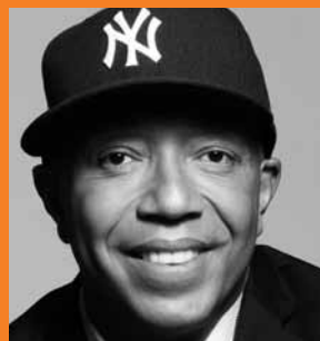
AUTHENTIC LEADERSHIP Russell Simmons Chairman and CEO, Rush Communications