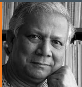
Muhammad Yunus CEO, Grameen Bank, Nobel Peace Prize Winner