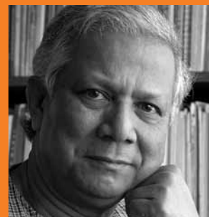
SOCIAL BUSINESS: A NEW KIND OF CAPITALISM Muhammad Yunus CEO, Grameen Bank

Be inspired by leaders who revolutionised the way we communicate, invest, shop, use technology, act and live.