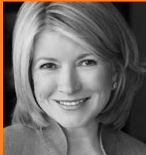
THE BUSINESS OF BUILDING A BRAND Martha Stewart Founder, Martha Stewart Living Omnimedia

— This event will sell out so book now to avoid disappointment. —