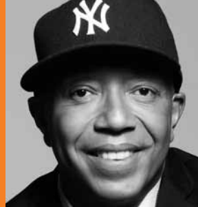
Russell Simmons Legendary Hip-Hop Entrepreneur; Chairman and CEO, Rush Communications