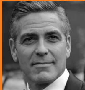
THE POWER OF COLLABORATION George Clooney Actor, Activist, Co-founder Not On Our Watch and Satellite Sentinel Project